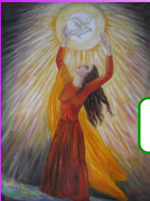
Magnificat, Painting by Flora Lalli