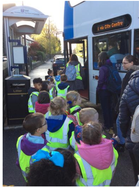
Travel on a bus