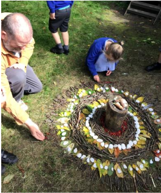
Working with artist