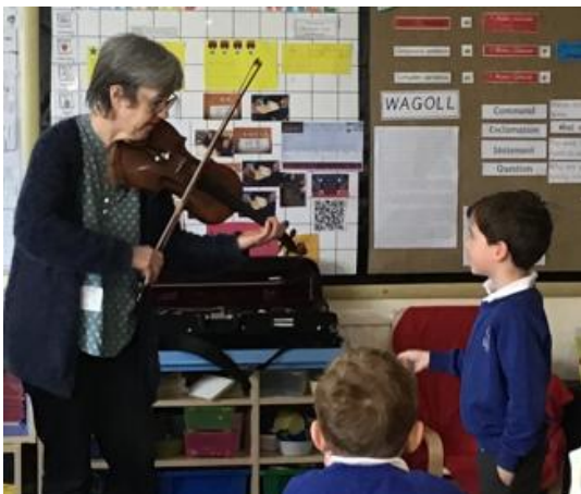
Play an instrument